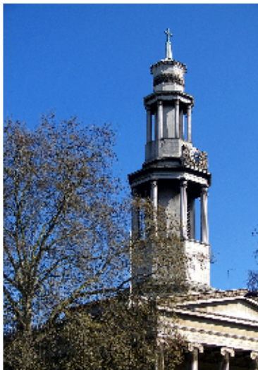
Tower, St Pancras Parish Church